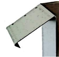
Recommended shape of slug fence

- Water your garden in the morning, rather than at night.