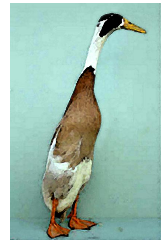
Indian Runner Duck