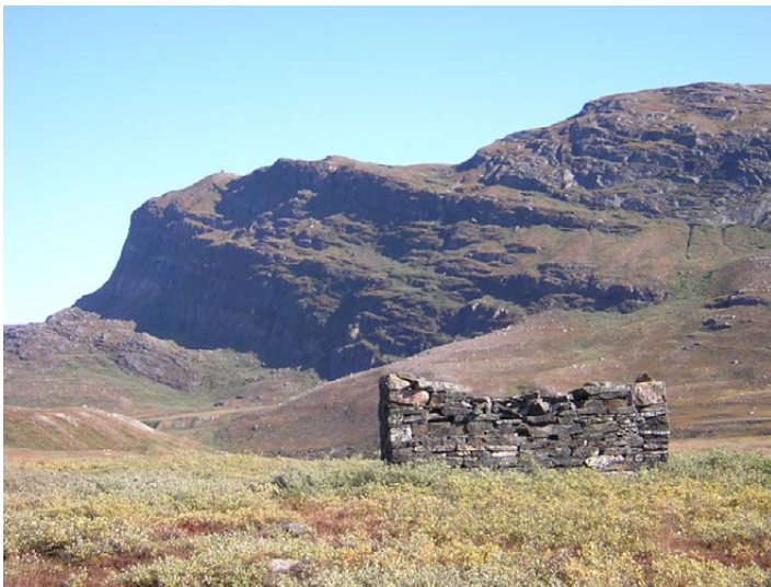
The once thriving Norse civilisation on Greenland lies in ruins. Will Iceland soon look the same?

To the sceptics it might be added that precedent cases do exist. Around the year 1000 A.D., Icelandic settlements on Greenland had to be abandoned for several reasons. Archaeological observations of the western viking settlement have shown that an overpopulation of butterfly larvae must have been a crucial factor. Remains of their cocoons were found in thick layers. The larvae attacked the sparse vegetation that the settlers were dependent on to feed cattle and sheep. Thus, the settlers were deprived of their means of existence.